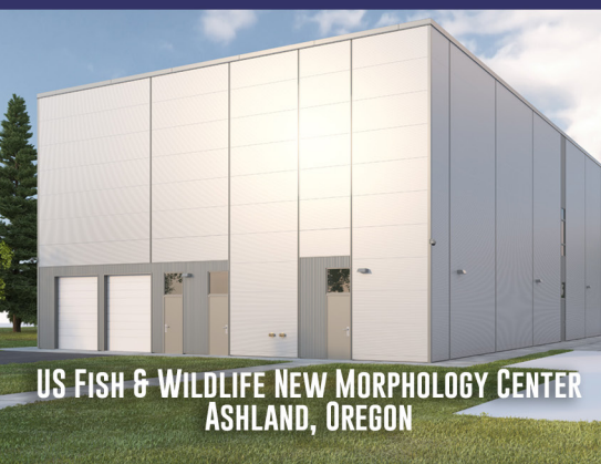
US FISH & WILDLIFE NEW MORPHOLOGY CENTER ASHLAND, OREGON