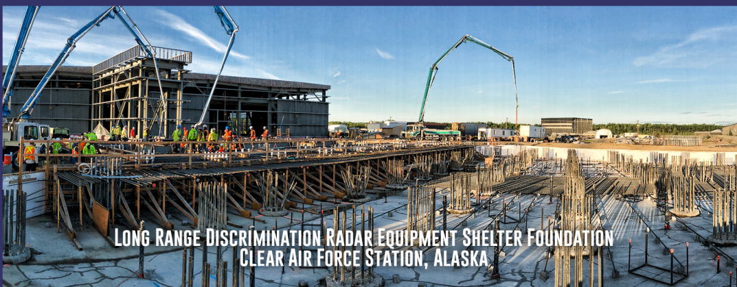
LONG RANGE DISCRIMINATION RADAR EQUIPMENT SHELTER FOUNDATION CLEAR AIR FORCE STATION, ALASKA